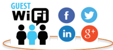
AirTight Social Wi-Fi™